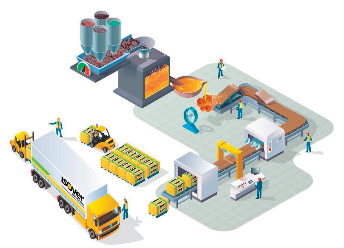
Figure 1. A scheme of manufacturing process of the stone wool.

Rocks are graded and crushed, mixed with coke and slags, and recycled materials then melted in a furnace at a temperature of 1500 °C. The melt is directed onto rotating wheels where it is spun into wool. Small quantities of resin binder are added to lock the fibers together. The wool is formed into a carpet which is cured and compressed in an curing-oven. Then it is cut and possibly covered with facing materials.